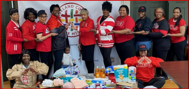
Shelby Alumnae Chapter Delta PHAST Committee